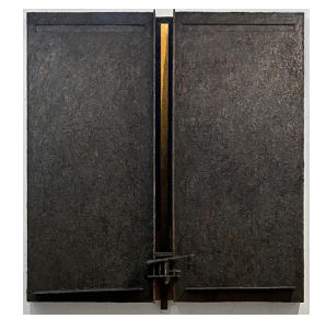
Brian Dickerson <u>DESCENT</u> 2024 72 x 68½ x 7½"

Please click on image or title for downloadable Higher Resolution version