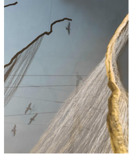
Millicent Young <u>Sutra for</u> <u>Belonging</u> 2024 144 x 240 x 140in