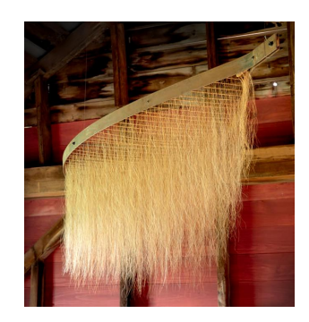
Millicent Young, <u>HUSKS</u>,2023 Dimensions variable