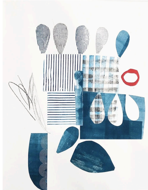
Susanna Ronner, Weave , monotype on paper, 28 x 22 inches