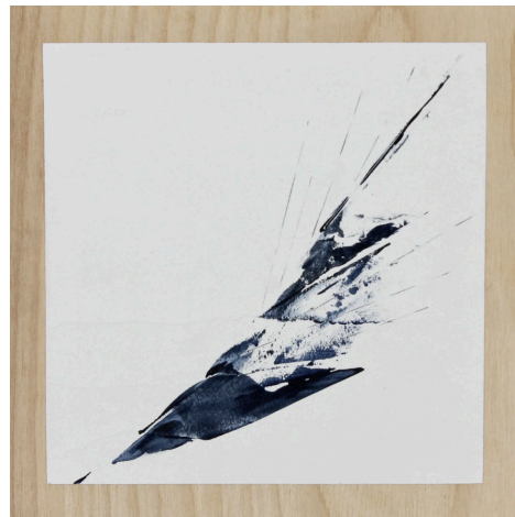
Gabriella Kirby, The Notes They Were Singing #3 , 2021, Acrylic, graphite on plaster coated wood panel, 7" x 7" inches